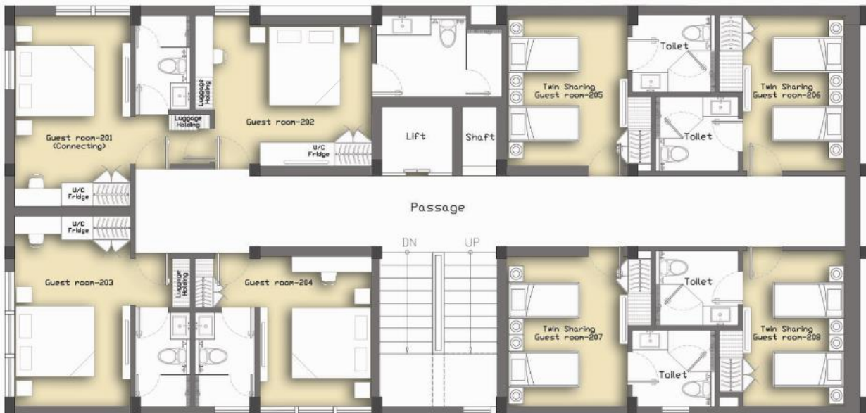
Second and Third Floor